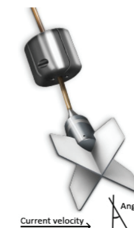
Fig 1: The work of Feedflow

The measuring and processing components can be seen on the horizontally mounted card inside the instrument. Digital tilt signals from the sensor are continuously received by the microprocessor and converted to flow values. In addition angle values is presented in degrees with magnetic north as origin.